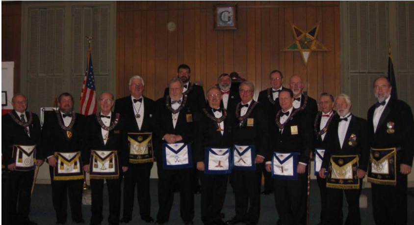
York Lodge No. 22 Installation 2014

I want to take this opportunity to wish each and every Brother and their family, a Joyful and Safe Holiday season! I wish to express my extreme gratitude for the opportunity you have given me, to serve as Master of York Lodge for 2014. With your assistance, I hope to make it a great year!